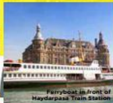
Ferryboat in front of Haydarpaşa Train Station

I stanbul has been populated by the humankind since the 6th century BC. Including Roman, Byzantine and the Ottoman Empires, this very old but fascinating city functioned as a home to many tribes, nomads and of course; civilizations. Not only hosting, İstanbul was also the administrative and religious center of these three empires mentioned. What this privilege brings about is an endless reserve of religious places, historical buildings, museums, palaces, structures carrying the characteristic features of a number of different human societies. Maybe this is the reason why İstanbul has always been a city full of tolerance towards any kind of diversities. In İstanbul, mosques, churches and synagogues stand side by side.